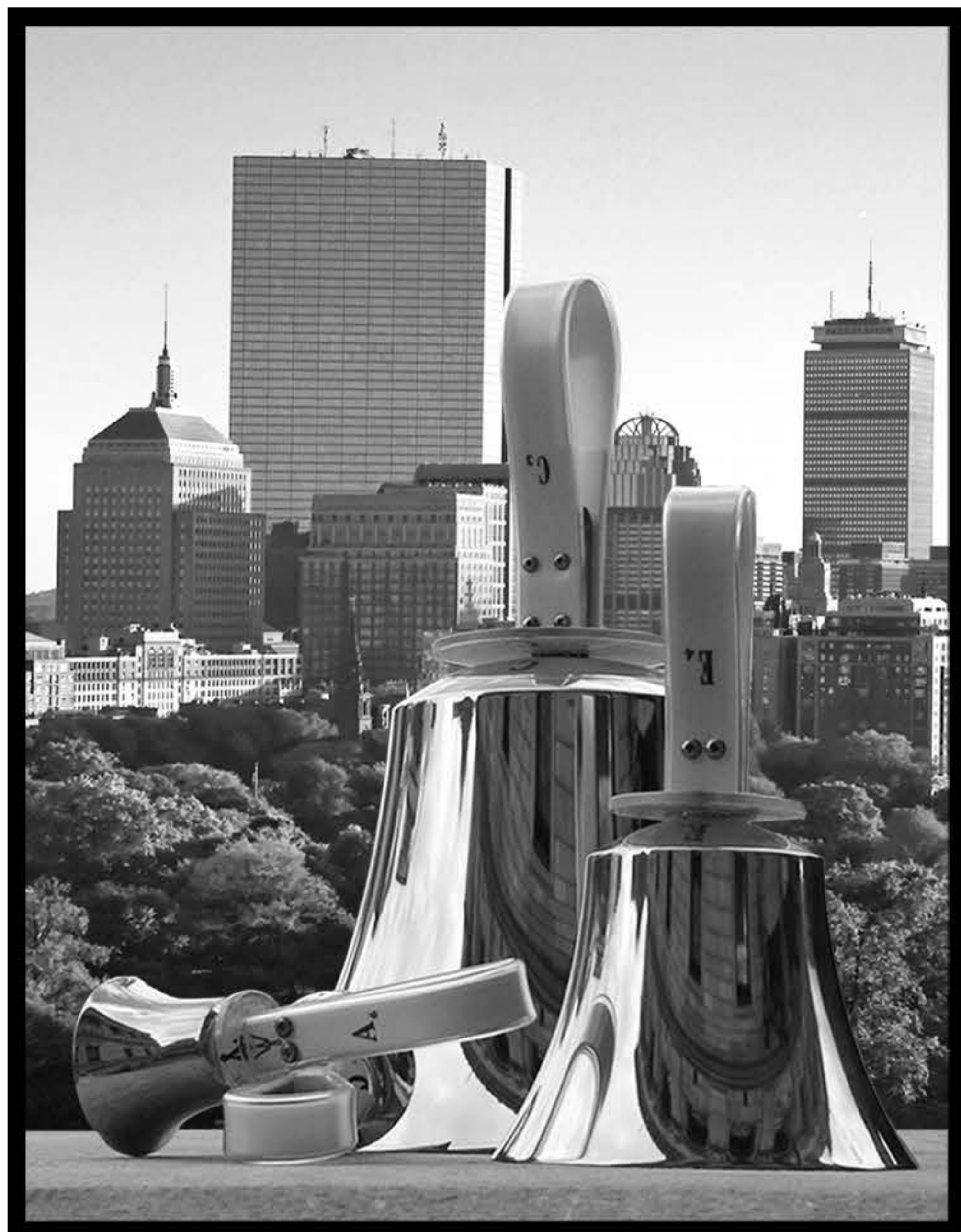
Skyline photograph © Stephen Orsillo

BACK BAY RINGERS NEW ENGLAND RINGERS MERRIMACK VALLEY RINGERS OLD SOUTH RINGERS HIGHLANDS CHIMES